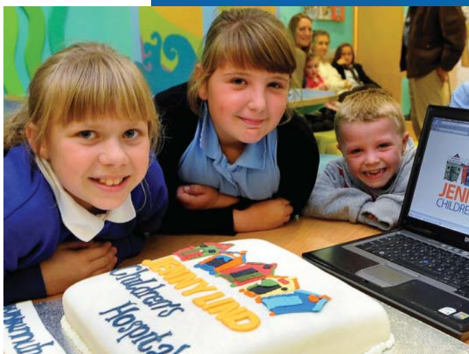
Child friendly: the Jenny Lind Children's Hospital home page (above) and celebrating the launch of the interactive website (left)